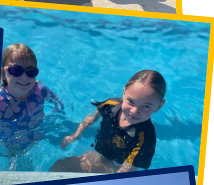
Friday, school students travelled to Penola where they spent the day learning putting their swimming skills into practice in a pool setting. It was a great day out!