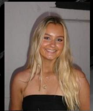
BY EMILY LAURENSEN

VARIETY OF STYLES: HIP HOP JAZZ CONTEMPORARY/LYRICAL HEELS